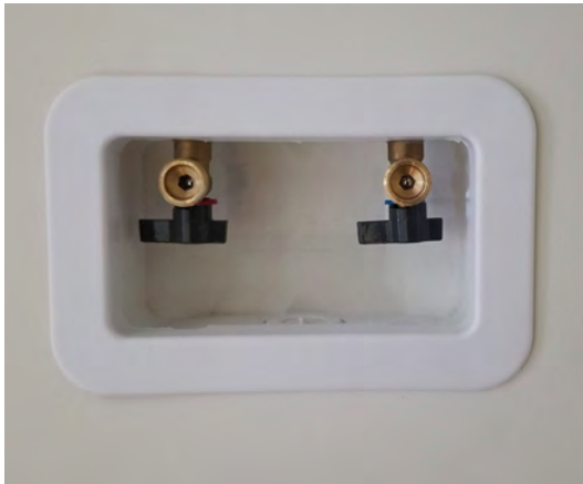
Laundry Machine shut-off valves. Typically located beside or behind laundry machine. Refer to Homeowners Manual for suggested shut off times.

Please ensure the water to your washing machine is turned off after each use. This is very important, especially if you are away for the weekend or on vacation. Should the water hose fail, you may be responsible for the damage not only to your suite but possibly other suites. To turn the water supply off, simply turn the handles or valves into the off position (where the hoses are connected (see picture below).