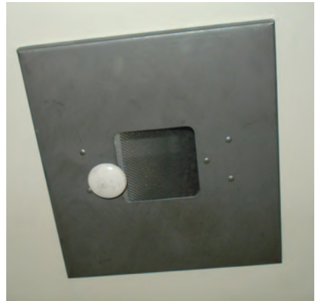
Laundry Room Lint Trap. Typically located above washer/dryer.