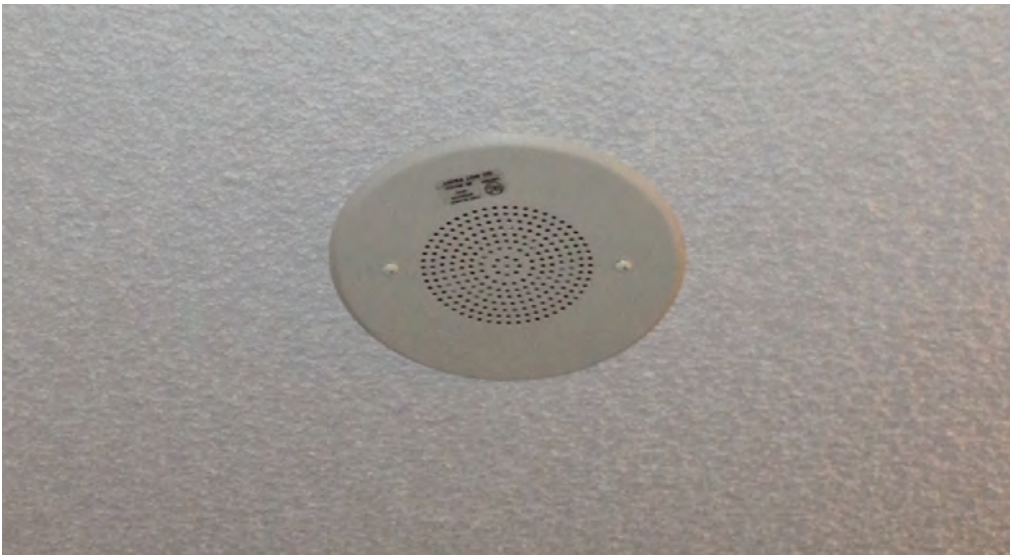
Fire Alarm Speaker – Do not disconnect